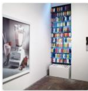
The Promise of the Image at Carriage Trade