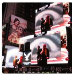
JR's Midnight Moment