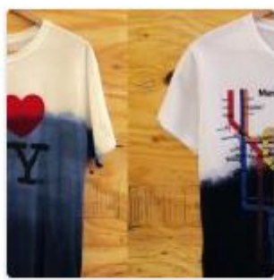
I STILL LOVE NY