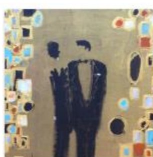
Creative Capital Auction at Pulse NY