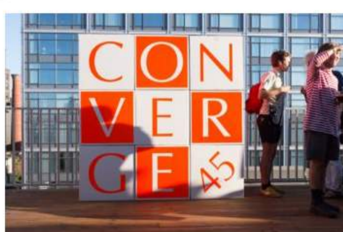
Last year's Converge 45.

Converge 45, an art festival in Portland, Oregon, has announced the group of artists, curators, and organizations set to participate in its upcoming second edition. Jennifer Steinkamp, Jim Hodges, and Catherine Opie are among the 24 artists who will have work on view as part of the program.