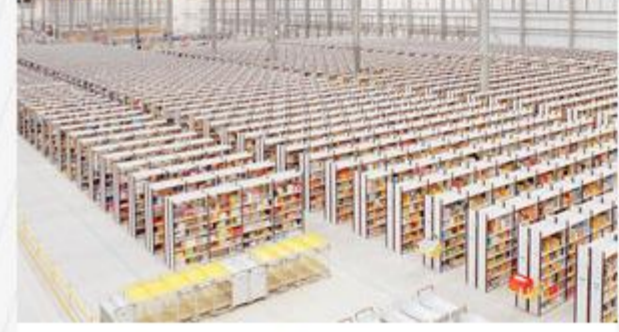
Think Your Office Is Soulless? Check Out This Amazon Fulfillment Center