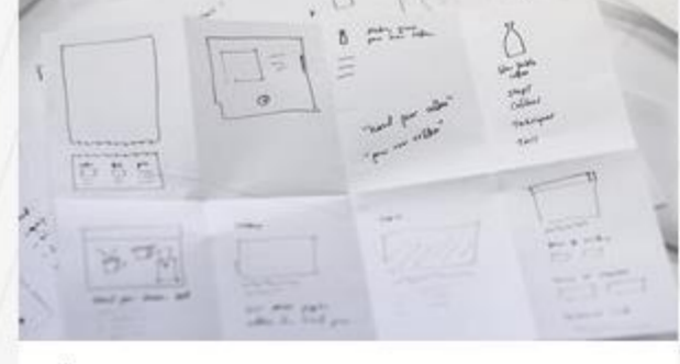
The 8 Steps To Creating A Great Storyboard