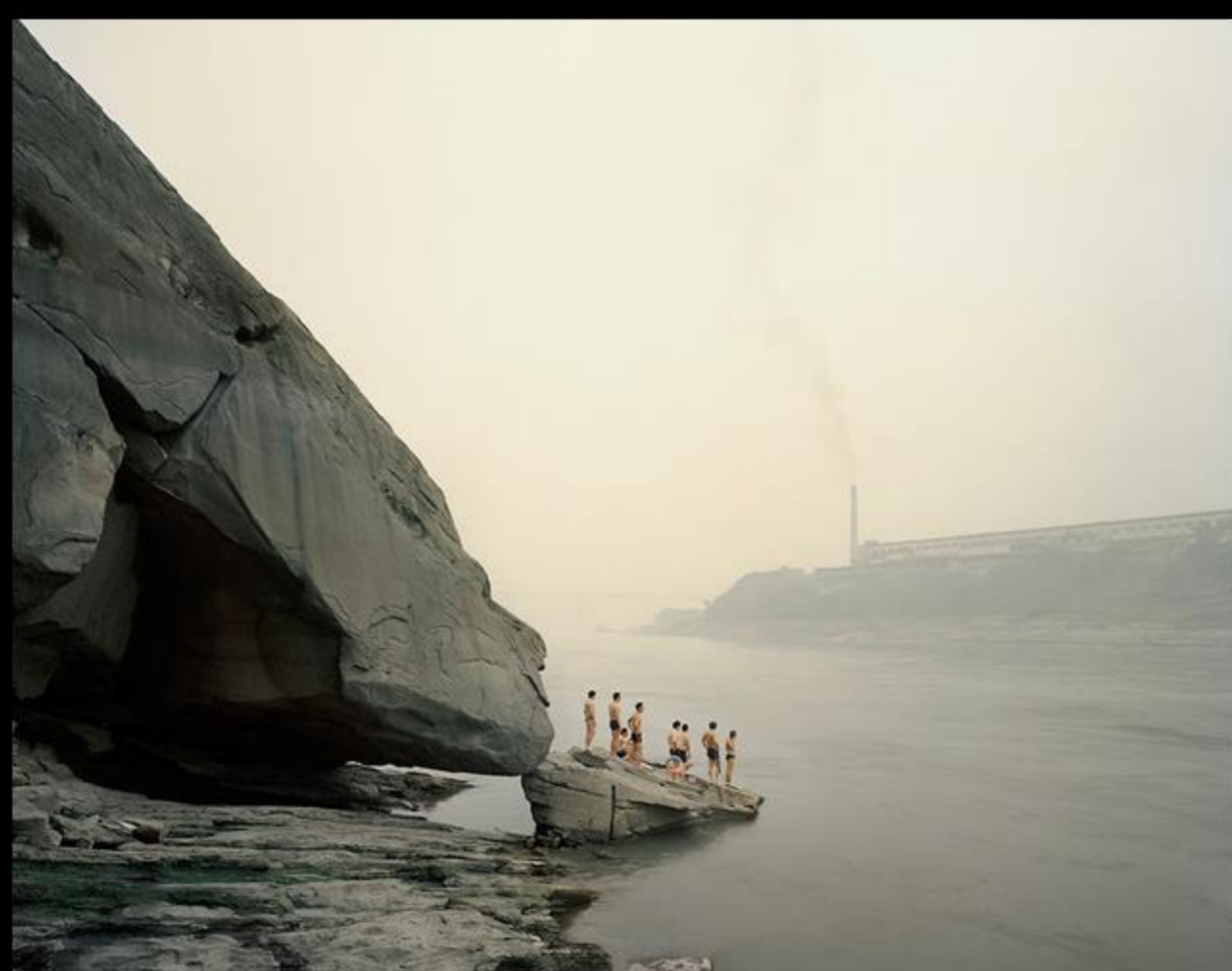
Yangtze: The Long River depicts the world's third longest river, an important part of China's economy.