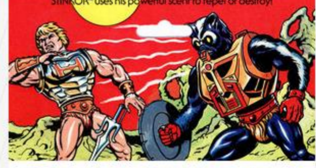
Why This Vintage He-Man Action Figure Still Smells Bad 30 Years Later