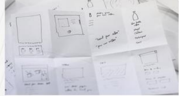
The 8 Steps To Creating A Great Storyboard