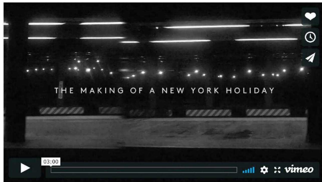
The Making of a New York Holiday from Barneys The Window on Vimeo .