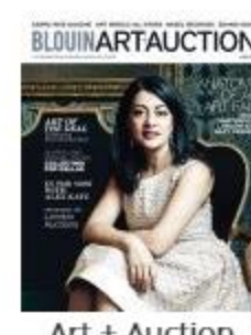
Art + Auction

BLOUIN lifestyle.com The Magazine Where Luxury Meets Art.