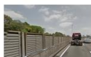
Turn Google Street View into Google Road Trip