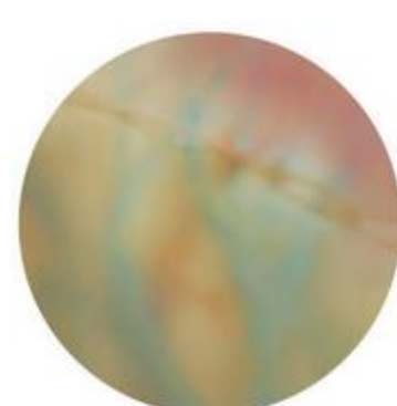
Gwen Hardie, "Body 09.13.09" (2009)

Skin is a multifarious concept — it brings to mind the outermost surface of things, or, perhaps, the condition of vulnerability that comes when our skin is exposed. The artists in Borderline take on skin as way to connect to the human body; by depicting and appropriating our corporeal forms, the three women presented here reach toward deeper issues, approaching themes of connection, endurance, and intimacy.