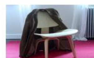
Will the UK's New Design Copyright Law Kill Innovation?