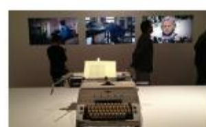
An Imperfect Exhibition of a Near-Perfect Director, Stanley Kubrick