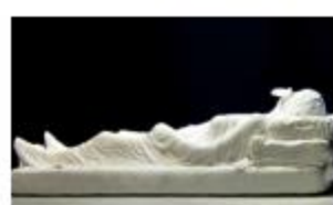
The Alchemy of Sorrow: Mixing Memorial Art with Contemporary Sculpture