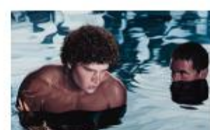
Hinting at Indescribable Desire through Lush Paint