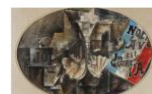
Donation Promises to Transform Metropolitan Museum into Major Cubist Art Center