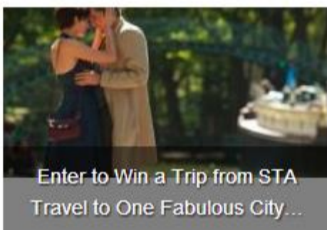
Enter to Win a Trip from STA Travel to One Fabulous City...