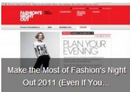
Make the Most of Fashion's Night Out 2011 (Even If You...)