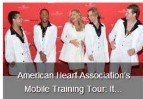
American Heart Association's Mobile Training Tour: It...