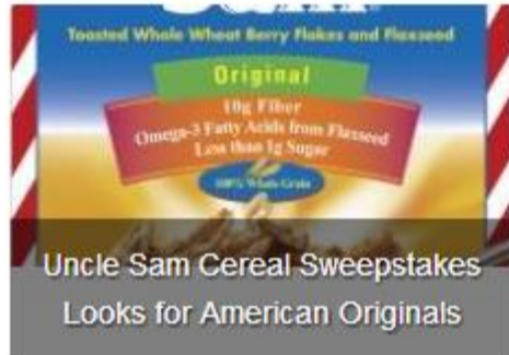
Uncle Sam Cereal Sweepstakes Looks for American Originals