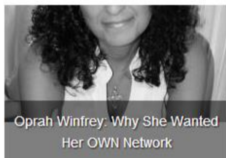
Oprah Winfrey: Why She Wanted Her OWN Network